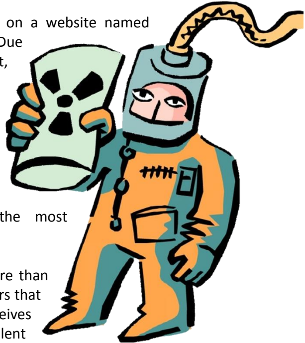
Original NukeWorker Logo

Online OSHA training such as the 8 & 40 Hour Hazwoper were added in 2006 due to popular demand.